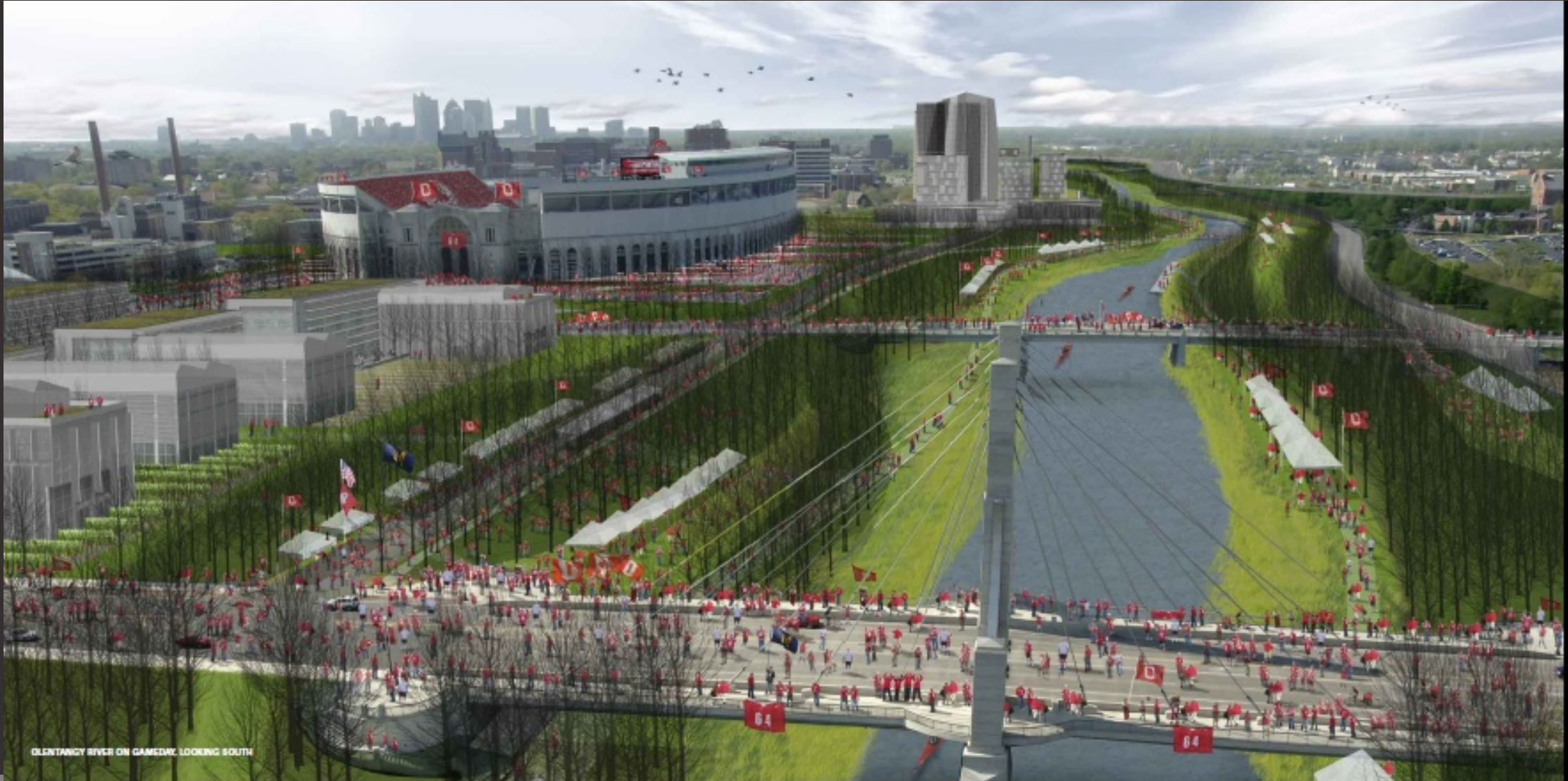
OLENTANGY RIVER ON GAMEDAY, LOOKING SOUTH

Long-term concept based on the One Ohio State Framework Plan and other enabling projects.