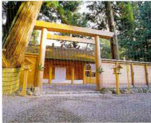
The Main Sanctuary ( Shōgū )