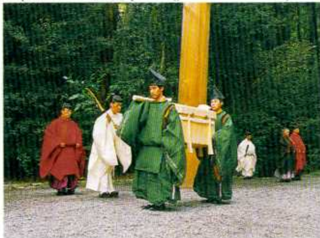
Kannamesai Hōhei Ceremony (Imperial Offerings of Silk and other Materials brought to Jingū by an Imperial Envoy)

The building situated to the right of the saikan is for the exclusive use of their Majesties the Emperor and Empress on the occasion of their pilgrimage to Jingū. For example, in November 1990, following the Sokuinorei and Daijōsai ceremonies, the Emperor and Empress stayed in the saikan prior to the Goshin'etsunogi in which they proclaimed the news of the enthronement to Amaterasu Ōmikami. Three times a year, the Emperor sends an envoy to Jingū to officiate at major ceremonies on his behalf. Moreover,