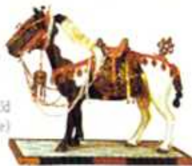
Sacred Treasure Tsurubushige no On'eriums (Statue of a Piebald Horse with Saddle)

Scroll of the procession of the Sengyo, in which the symbol of the kami ( goshintai ) is placed in a series of containers and ceremonially carried within a long silk shroud, along with sacred treasures and apparel, from the old sanctuary building to the new. This picture-scroll depicts the transfer ceremony of Naikū as it took place in the 58th Shikinen Sengū, and as it is expected to take place on the occasion of the 62nd Shikinen Sengū of October 2013, that is to say from the eastern to the western sanctuary grounds. ▶