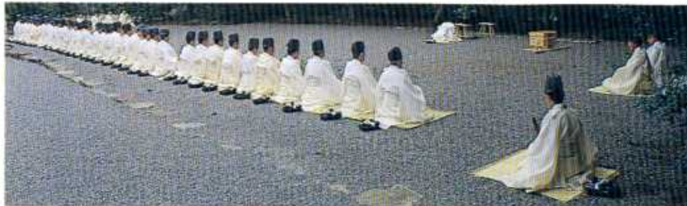
Ōharai (Purification Ceremony)

There are approximately one hundred priests who officiate in Jingū. They are headed by the saishu (Master of the Ceremonies), who is assisted by the daigūji (Superintendent of the Sanctuaries) and the shōgūji (Second to the Superintendent of the Sanctuaries), followed in hierarchical order by the remaining priests.