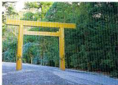
Daini Torii (Second Sacred Gateway), Naikū

The style of torii called shinmei dorii is particular to Jingū, and is said to be the purest form of torii architecture. Sacred branches of sakaki along with folded strips of white paper ( shide ), which are indices of sacred space, are affixed to each pillar as well as to the gates and fences that surround the main sanctuary. They are replaced by fresh branches every ten days and before major ceremonies.