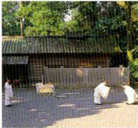
Higotoasayūōmikesai (Ceremonial Offerings of Sacred Foods twice daily in the Mikeden), Gekū

The first auxiliary sanctuary of Gekū is Takanomiya, situated atop an elevation on the southern side of the sanctuary. Other auxiliary sanctuaries include Tsuchinomiya, dedicated to the kami of the earth, and Kazenomiya, dedicated to the kami of the wind.