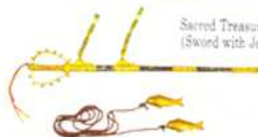
Sacred Treasure Tamamaki no Ontachi (Sword with Jewel-Studded Scabbard)

Originally, Amaterasu Ōmikami was revered within the Imperial palace by successive Japanese Emperors. However, in the era of the tenth Emperor, Sujin Tennō (first century B.C.), in awe of the divine authority of Amaterasu Ōmikami, the august mirror (symbol of the kami, or goshintai ) was moved from the Imperial palace by the Imperial Princess Toyosukiirihime no Mikoto and was revered in Kasanuinomura. Thereafter, during the reign of the eleventh Emperor, Suinin Tennō, in respectful obeisance of the divine command of Amaterasu Ōmikami for a more appropriate sanctuary, the Imperial Princess Yamatohime no Mikoto departed from Kasanuinomura. After searching in other regions, finally in the twenty-sixth year of the reign of Emperor Suinin (4 B.C.), she decided upon the present sanctuary of Naikū, by the upper Isuzu river, as the place where Amaterasu Ōmikami should be enshrined for eternity.