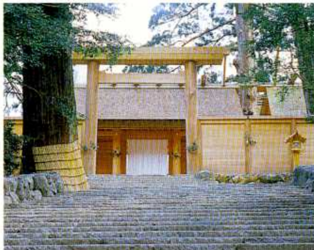
The Main Sanctuary (Shōgū)

Pilgrims who come to worship in Jingū generally do so before the gate of the second outer fence of the main sanctuary. However, special pilgrimages may also be made by individuals or groups of pilgrims in the nakanoe (court) within the second outer fence. The way in which one worships in Shintō is as follows: two deep bows are followed by clapping the hands twice and bowing deeply once again.